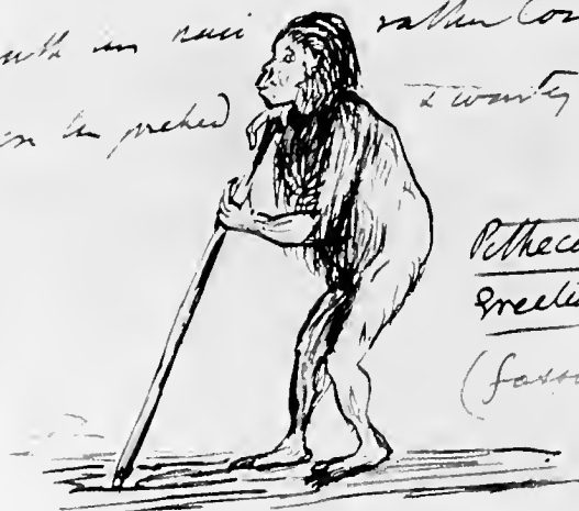
Pithecanthropus erectus Dubois (fossil)

turned up mulling like the morning side in Java - around the paper I have not received from Mark. I expect he was a Torvater, partly with an Asiatic rather Cow down on the neck & warty cheeks.